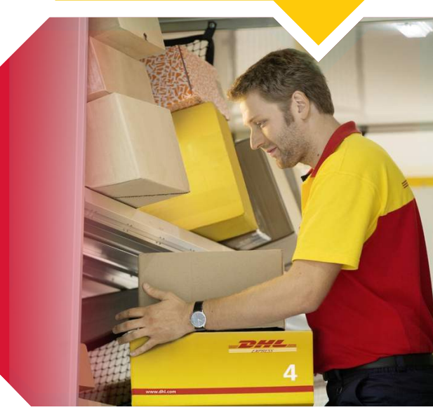
Shipment is loaded and bound for importation into Brazil via Courier mode.